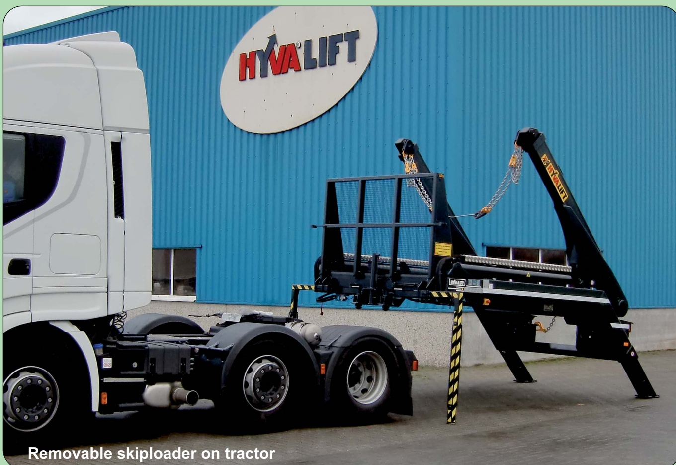
Removable skiploader on tractor